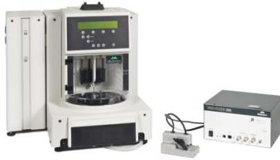
Viscosizer 200 - Viscosity & Size