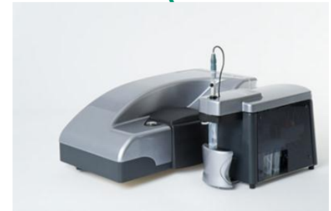
Zetasizer - Size & Zetapotential